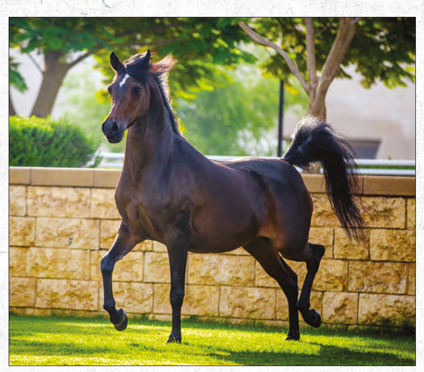
Mishaah (JK Spartan x Mistral Bey)